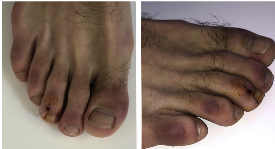
Fig 1. Coronavirus disease 2019–induced chilblains. Violaceous infiltrated plaques that appeared abruptly on an erythematous background, with features typical of chilblains.