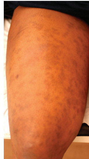
Fig. 1. Numerous hyperpigmented macules involved the lower limbs.

On clinical examination, there were numerous hyperpigmented macules on the lower limbs, and, to a lesser extent, on the upper extremities and the trunk (Fig. 1). The macules were rounded and ill-defined, with some lesions being slightly infiltrated on palpation. The macules were also distributed in a racemosa (grape-like) pattern (Fig. 2). The patient carried a diagnosis of post-inflammatory pigmentary alteration (PIPA); however, PIPA was not probably because of the absence of any prior inflammatory lesions or a history of topical medication use. Laboratory studies showed an increased erythrocyte sedimentation rate (ESR) and positive anticardiolipin and anti- \beta_2 glycoprotein-1 antibodies. A complete blood count, hepatic, renal and thyroid function, antinuclear antibodies, anti-neutrophilic cytoplasmic antibodies (ANCA), complement levels, and urine analysis were all normal or negative.