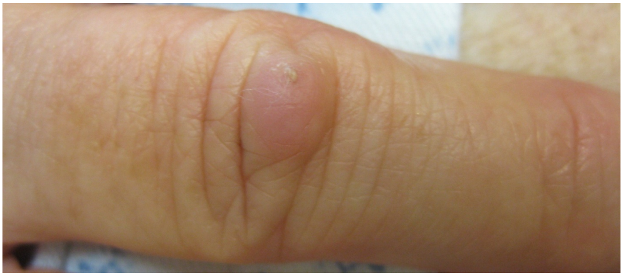
Figure 1. A tan-pink, freely mobile, rubbery papule with a central keratotic plug located over the extensor aspect of the proximal interphalangeal joint of the right 4 th finger